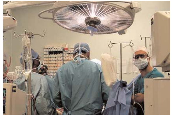
One of Europe's most advanced cardiac surgical theatres

One major videoconferencing link that Wessex has cultivated has been with the Mayo Clinic in the United States, whose interactive seminars are attended by up to 60 people in the Wessex lecture room. The TANDBERG 6000's video clarity is such that even detailed medical images and records can be interpreted unambiguously.