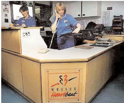
Wessex Cardiac Centre reception

TANDBERG is a leading global provider of visual communication products and services. The Company has dual headquarters in New York and Norway. TANDBERG designs, develops and markets systems and software for video, voice and data. The Company provides sales, support and value-added services in more than 90 countries worldwide. TANDBERG trades publicly on the Oslo Stock Exchange under the ticker TAA.OL. Please visit www.tandberg.net for more information.