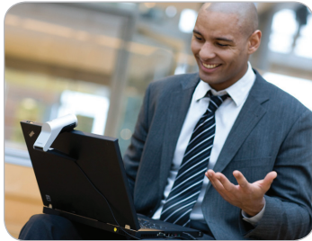
PrecisionHD™ USB Camera Superior Optics Required for HD Communications

TANDBERG WORLD HEADQUARTERS PHILIP PEDERSENS VEI 20 1366 LYSAKER, NORWAY TEL: +47 67 125 125 FAX: +47 67 125 234 VIDEO: +47 67 126 126 tandberg@tandberg.com